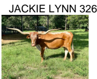
JACKIE LYNN 326