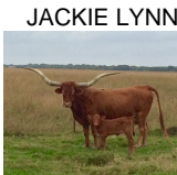
JACKIE LYNN 90