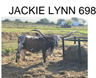
JACKIE LYNN 698