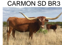
CARMON SD BR3